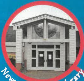
Newport Public Library