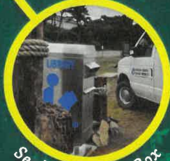
Seal Rock Drop Box