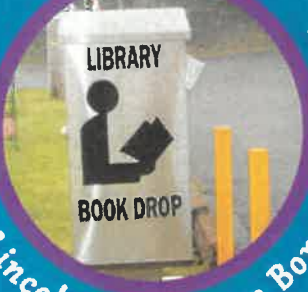
Lincoln Beach Drop Box