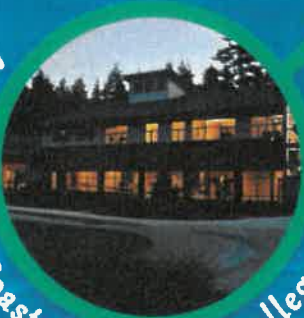
Oregon Coast Community College Library