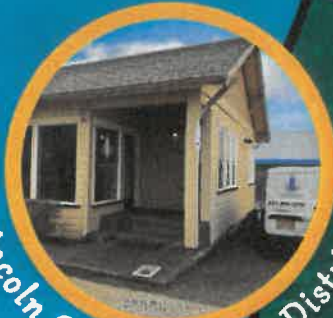
Lincoln County Library District