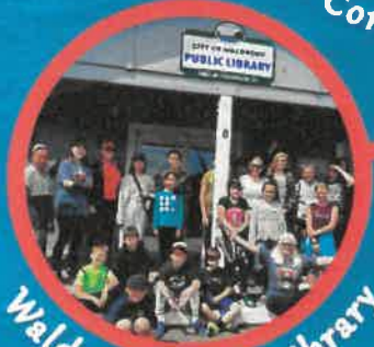
Waldport Public Library