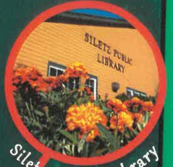
Siletz Public Library