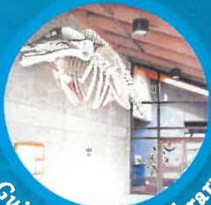
Guin (Hatfield) Library