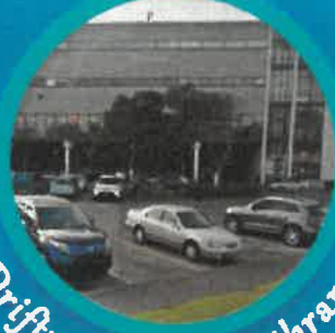
Driftwood Public Library